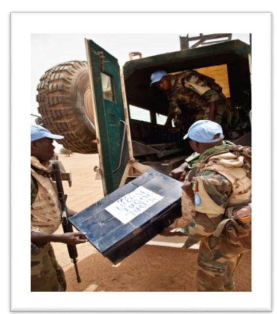
UN peacekeepers unload electoral materials in Kidal, Mali, for the presidential elections.

In addition to these responsibilities, MINUSMA was also tasked with helping to restore democratic governance by facilitating free and fair national elections. Given the important role played by the March 2012 coup in deepening and prolonging the disorder in the country's northern regions, the election of a legitimate civilian government was viewed by the international community as a crucial piece of a more comprehensive strategy to bring long-term stability to Mali. While there remains much work to be done in terms of rebuilding state institutions, extending their authority over recently liberated areas of the north, reforming the country's