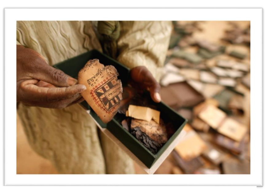
A burned artifact from the destruction at Timbuktu

Given the deep differences between the current House and Senate SFOPS bills, the possible lack of a fix for shortfalls originating in FY'13, and the potential for a CR based on the previous year's peacekeeping needs, there is a real possibility that